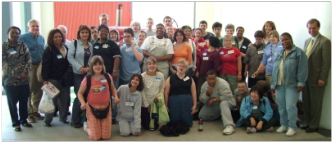
MDE ENVIRONMENT

Students from Howard County's Atholton High School recently toured MDE headquarters--the region's largest "Green Building." They also participated in a recycling demonstration, ran a watershed runoff model and received an air quality lesson.