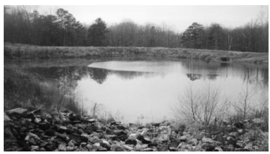
Cecil County Central Landfill's runoff is clean and clear thanks to the dedication of Cecil County employees

The Maryland Department of the Environment (MDE) and Cecil County government, landfill employees and citizens have worked to build a cooperative partnership to cleanup the Cecil County Central Landfills. Thanks to some innovative solutions and persistence Cecil County's historical landfill sediment and erosion problems are a thing of the past.