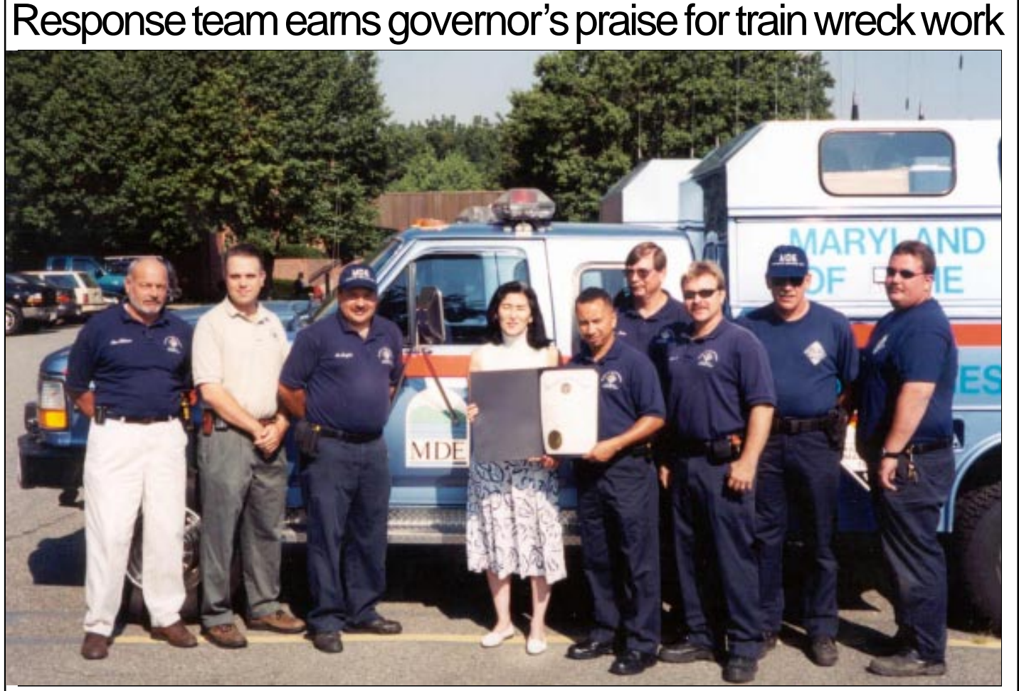
MDENVIRONMENT

for the Loop program. Our mission to foster stewardship and appreciation of