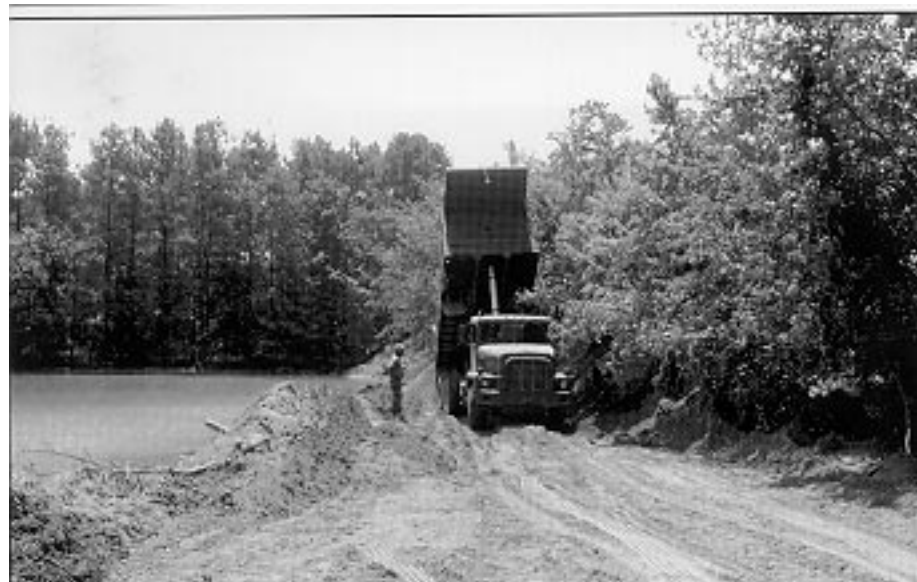
A dump truck delivers fill material excavated from the banks of Marshy Hope Creek to create the shallow water zone of the abandoned mine pond.

Once this area has been connected to the tidal waters of Marshy Hope Creek, the vegetated slope will also function as a tidal marsh, and fish will have access to the pond. Spawning areas will be expanded for anadromous fish such as Blueback Herring, Striped Bass, American and Hickory Shad, Alewife, and semi-anadromous species such as White and Yellow Perch. A trail system with interpretive displays will be added to the Marshy Hope Creek project site to provide educational opportunities for