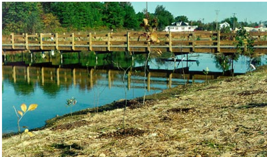
A boardwalk across new wetlands constructed near Federalsburg.

A nearby abandoned sand and gravel mine, that filled with water and is now a public safety hazard, will be the disposal site for approximately 20,000