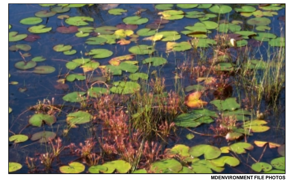
Legislation to protect newly discovered bog watersheds including the Moutain Road peatland, shown above, recently took effect in Anne Arundel County. The legislation protects the bogs from development by establishing a regulated 100-foot buffer.

In December 1999, the department was asked to include the newly discovered peatlands on