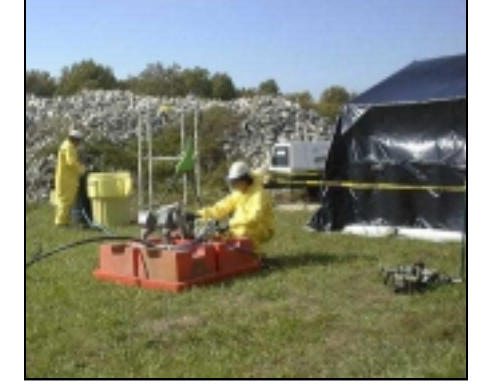
Site personnel prepare to start the injection process at the Mayfield Repair Facility in Howard County.

Chemical oxidation, a system that has only