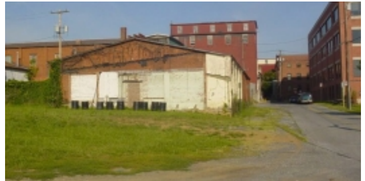
Sites like the one above in Frederick and this old service station at right in Cumberland will soon undergo evaluation.

The grant is a part of the new Small Business Liability Relief and Brownfields Revitalization Act signed by President George W. Bush in January 2002 to help states and communities around