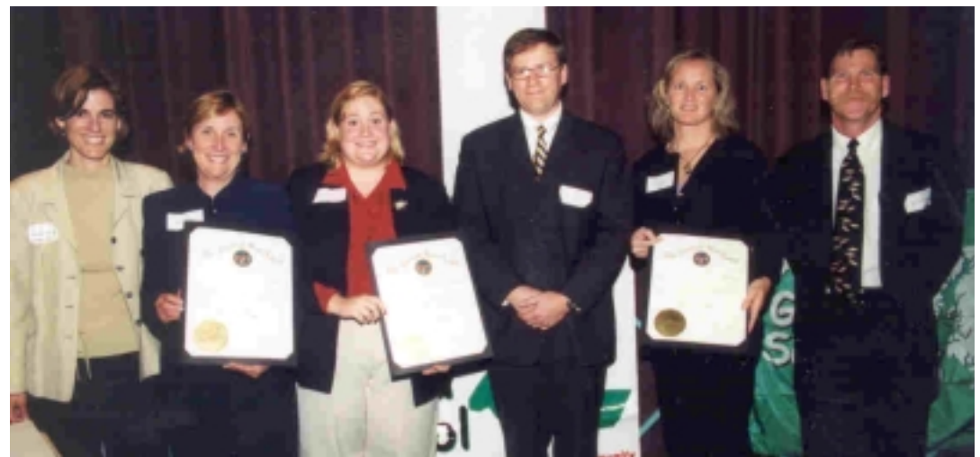
MDENVIRONMENT

The 2003 Green Schools were: Dowell Elementary, Hereford High School, John Poole Middle School, Kitzmilller Elementary, Linton Springs, Mill Creek Middle School, Mt. Airy Elementary, Northern Middle School, Plum Point Middle School, Pocomoke Elementary School, Pocomoke Middle School, Roland Park Country School, Wicomico Day School, and William S. James Elementary.