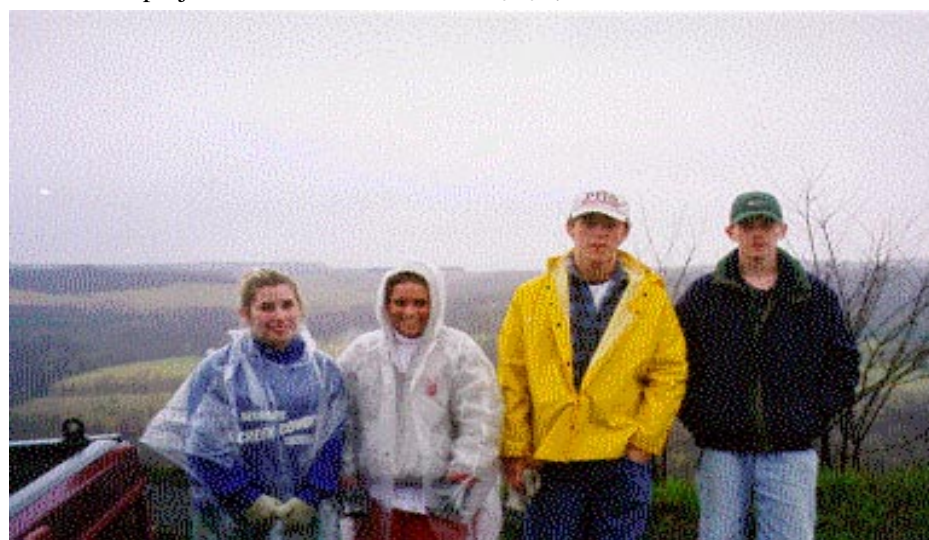
Students from Westmar High School's environmental studies class brave the elements to help plant trees.

For more information on any of these Western Maryland cleanup projects contact MDE at (301) 689-6104.