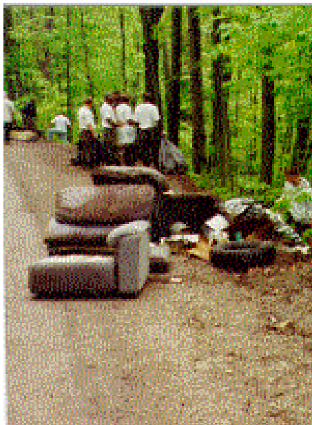
Community volunteers haul large debris from the stream and banks of the Mill Run.