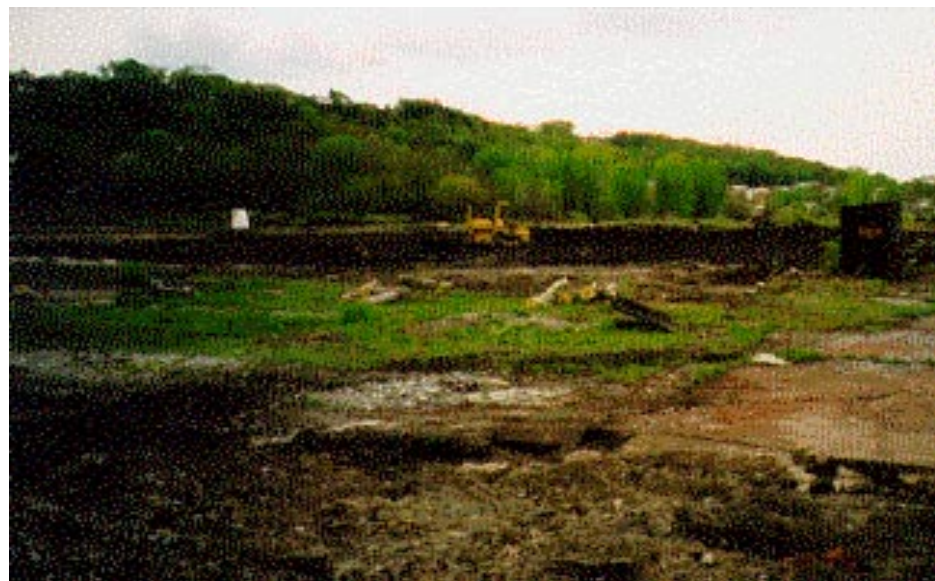
The CSX Bolt and Forge Property, pictured above, in the site preparation phase for Cumberland's newest supermarket and retail center.

Being accepted in the Voluntary Cleanup Program as an inculpable person also made ARC eligible to apply