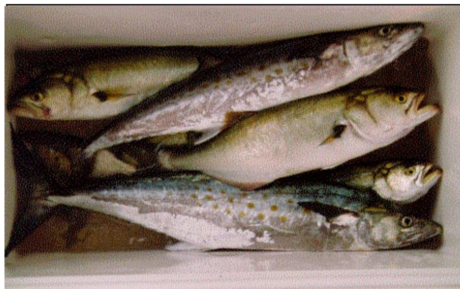
Fishermen are asked to report any fish with striking abnormalities.

The Governor's plan includes a comprehensive attack on other sources of nutrient pollution. The five-year capital budget provides funding for biological nutrient removal upgrades at all 14 major sewage treatment plants on the Eastern Shore within three years, and all remaining eligible sewage treatment plants statewide within five years. MDE also is working with local governments to