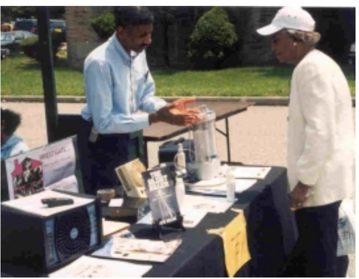
MDENVIRONMENT