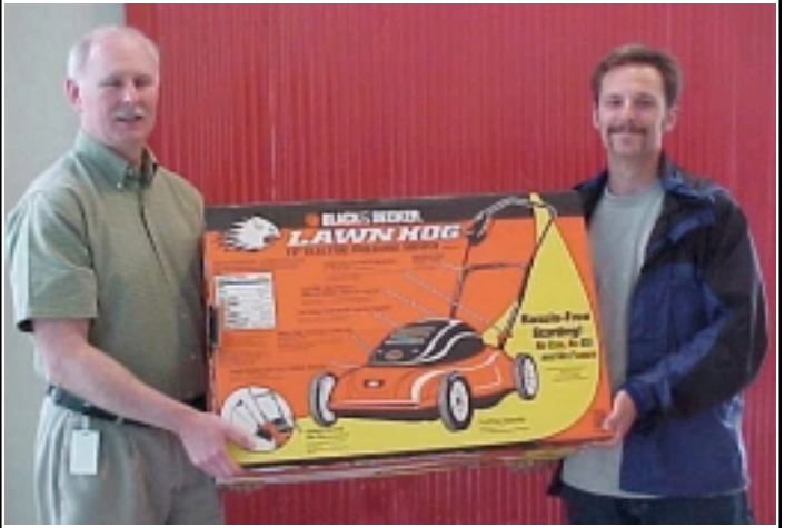
MDENVIRONMENT

This educational event is organized by the U.S. Environmental Protection Agency, Region III, the Pollution Prevention Programs of the Mid-Atlantic States and the Virginia Housing and the Environment Network.