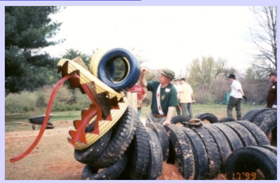
A local Boy Scout Troop Leader puts the finishing touches on the tire monster.

This is Maryland's seventh scrap tire playground and is expected to be a great asset to the community bringing visitors back to the park. MDE has plans to build another one of these extremely popular scrap tire playgrounds at Elk Neck State Park in Fiscal Year 2000.