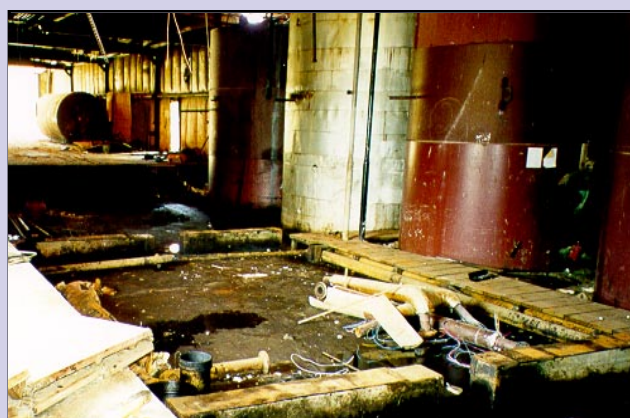
Above, a before shot of a creosote contaminated work pit at Eastern Maryland Wood Treating Company that once held a wood treatment cylinder and several large work tanks filled with tar-like creosote. Right, the same pit after final sealing of the structure with concrete.

A Florida investment company recently purchased the property at a Dorchester County tax auction. Local citizens are anticipating that this purchase will lead to redevelopment of the site and bring with it new jobs. Thanks to these cleanup efforts Dorchester County will soon have a viable business where a contaminated site once existed.