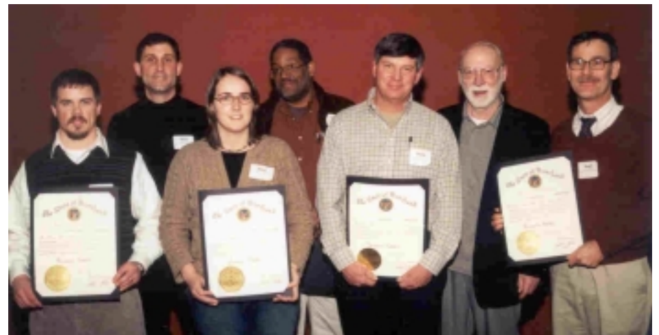
Above, 2002's Tributary Team Awardees are thanked for jobs well done.

tributary Team presents an award to a member that goes above and beyond the call of duty, furthering the Team's work to restore the Chesapeake Bay and its tributaries. The recipients by team are: