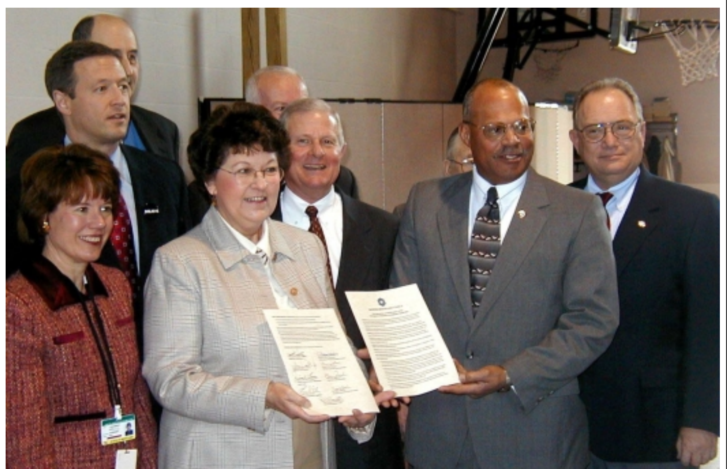
MDE ENVIRONMENT PHOTO BY JANICE OUTEN

MDE's programs include air quality control of stationary and mobile sources, management of hazardous and solid waste, oil control, regulation of wastewater discharges and public drinking water, wetlands protection, environmental risk assessment, and financial assistance for environmental restoration.