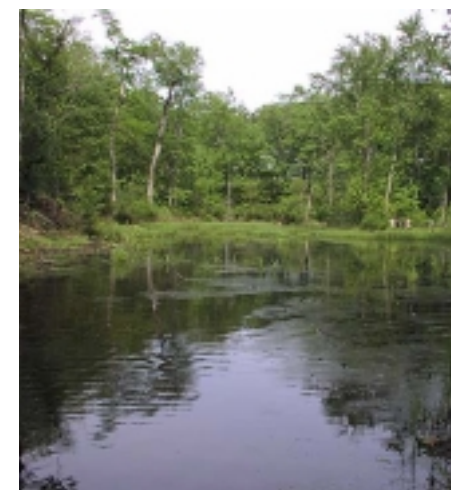
Above is the Adkins wetland along Route 376 in Worcester County.

"Maryland is committed to meeting these goals and in developing innovative solu-