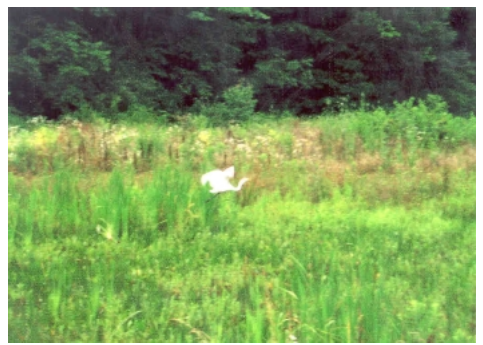
A great egret takes flight from one of Maryland's prime wetland habitat areas.

gain in wetland resources over time, through the regulatory program;