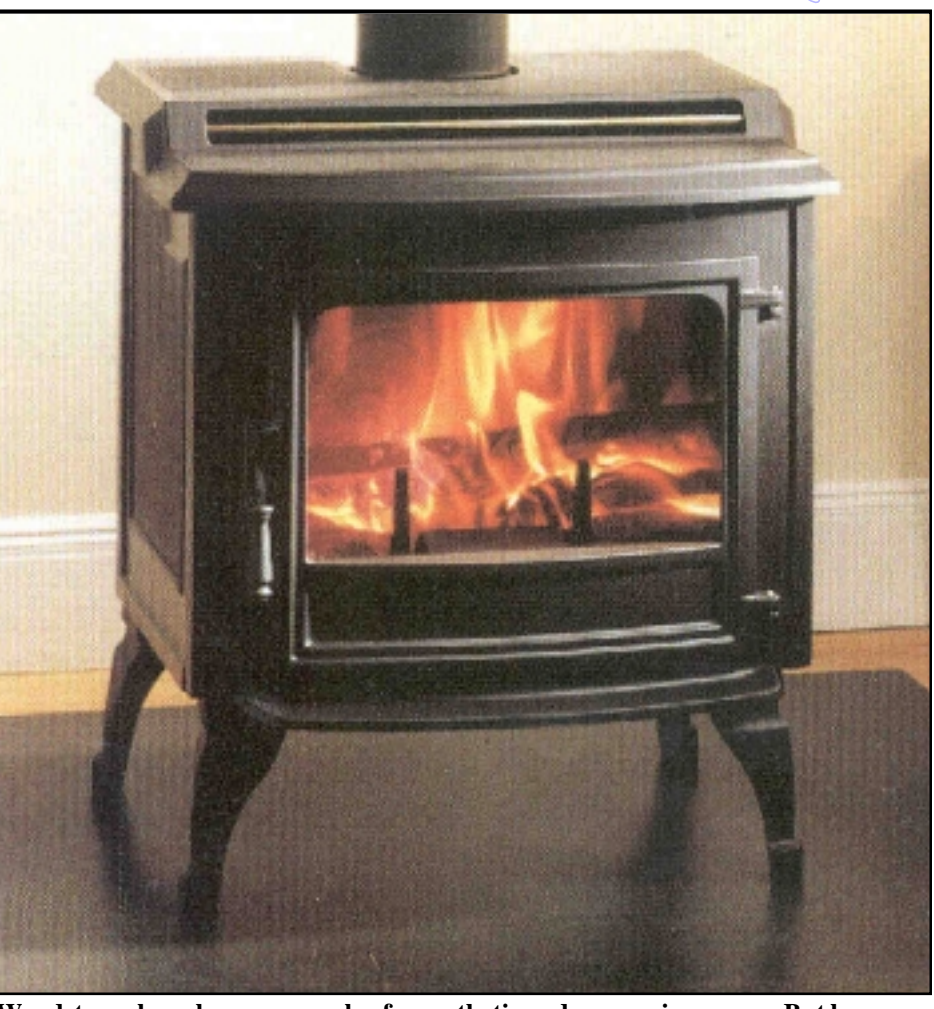
Woodstoves have become popular for aesthetic and economic reasons. But be aware of the risks involved in their use.