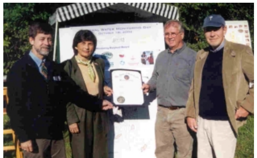
MDENVIRONMENT