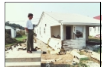
Governor Robert L. Ehrlich Jr. views a bayfront cottage damaged by Tropical Storm Isabel.