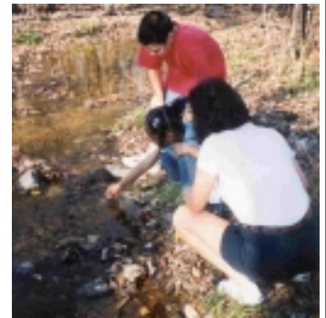
MDENVIRONMENT