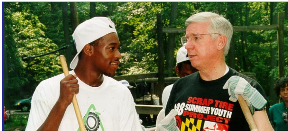
Governor Glendening talks with a summer worker during a break at the Patapsco State Park Project.

Governor Parris N. Glendening and Lt. Governor Kathleen Kennedy Townsend late last month joined teens working to refurbish a scrap tire playground at the Patapsco Valley State Park in Baltimore County in a partnership with Sears/National Tire and Battery, State agencies and the Patapsco Valley community as part of the 1998 Scrap Tire Summer Youth Employment Project.