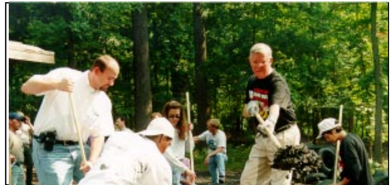
Governor Glendening pitching in with the 1998 Scrap Tire Summer Youth Employment Project workers.

This past year, Governor Glendening served as one of two lead governors on technology and also was a member of the NGA's Committee on Human Resources and the Children's Task Force.