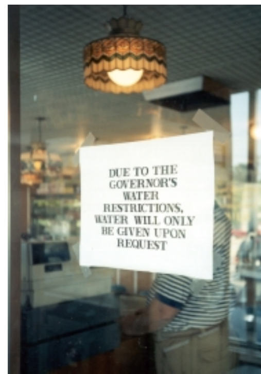
Towson's Bel-Loc Diner is just one of many businesses cooperating with drought restrictions.