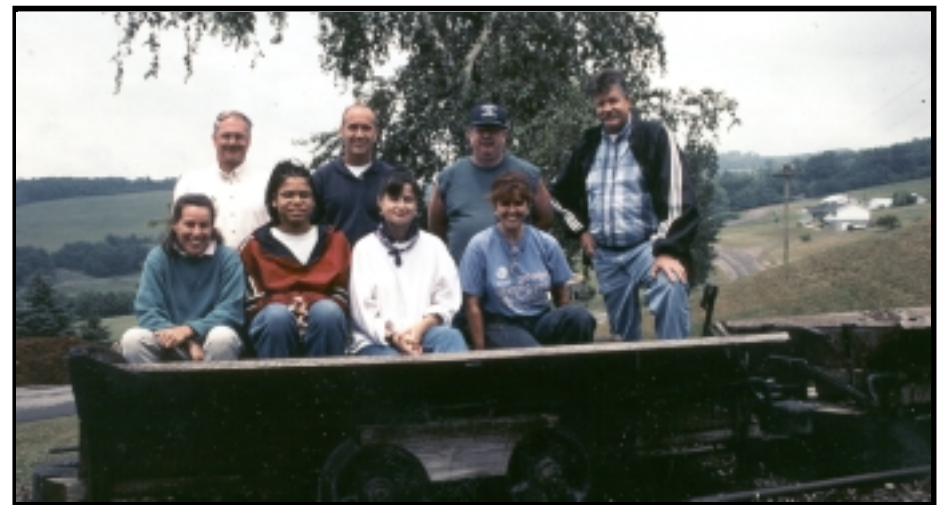
MDE staff and task group members on a learning field trip to a local mine.

MSDE assembled a talented group of four teachers to take on the writing task. Staff from MDE took the teachers on tours of a coal mine, two-rock quarries and a sand and gravel mine. Familiarizing the teachers with the mining process and all of the uses of mined products was thought to be the best way to help them focus on the lesson plans. The teachers had a terrific time and asked lots of questions of the industry representatives. They then spent a week writing the draft of the lesson