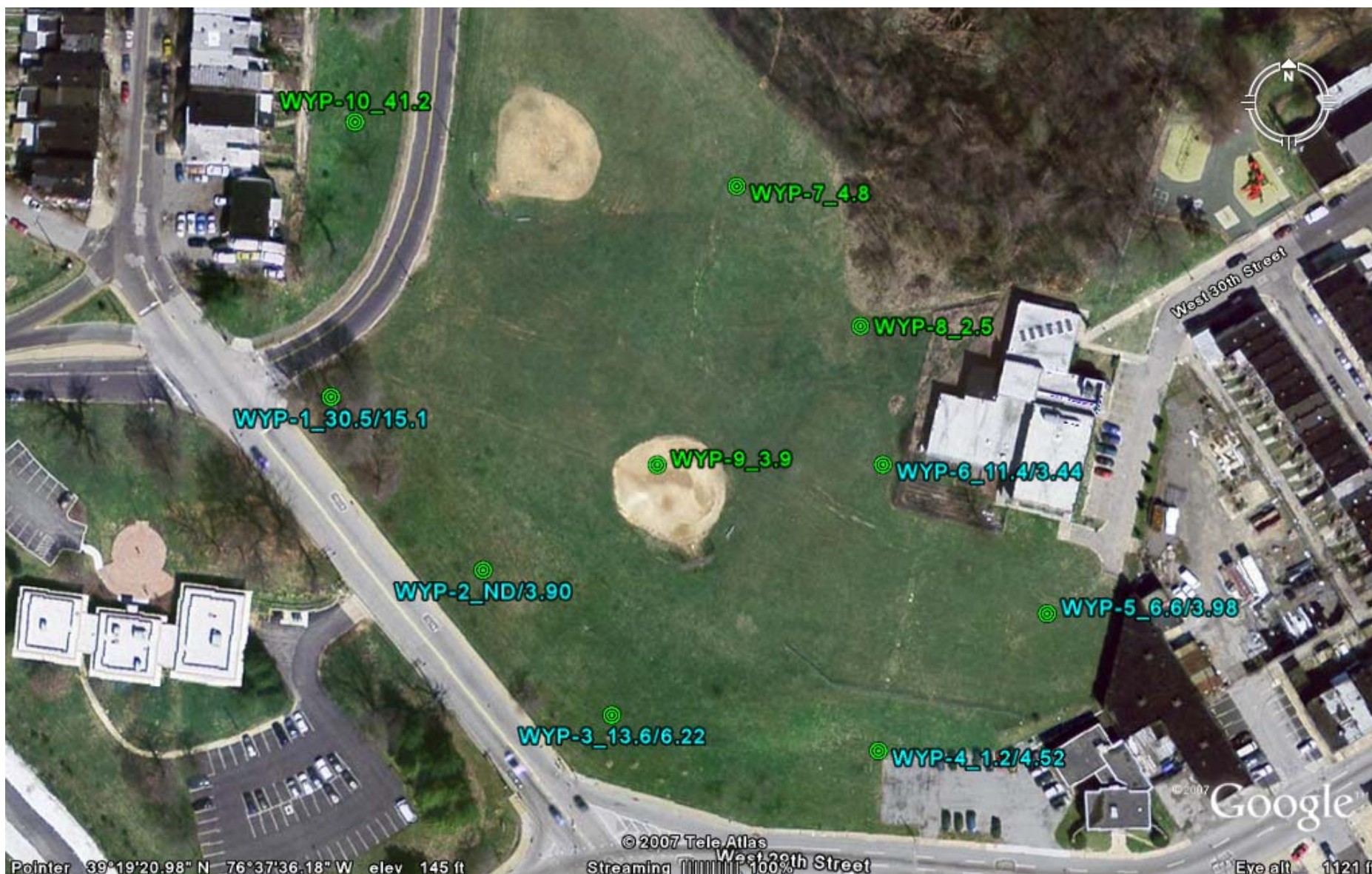
Green text – XRF data. Blue text - both MDE XRF and DHMH analysis run (XRF/DHMH).