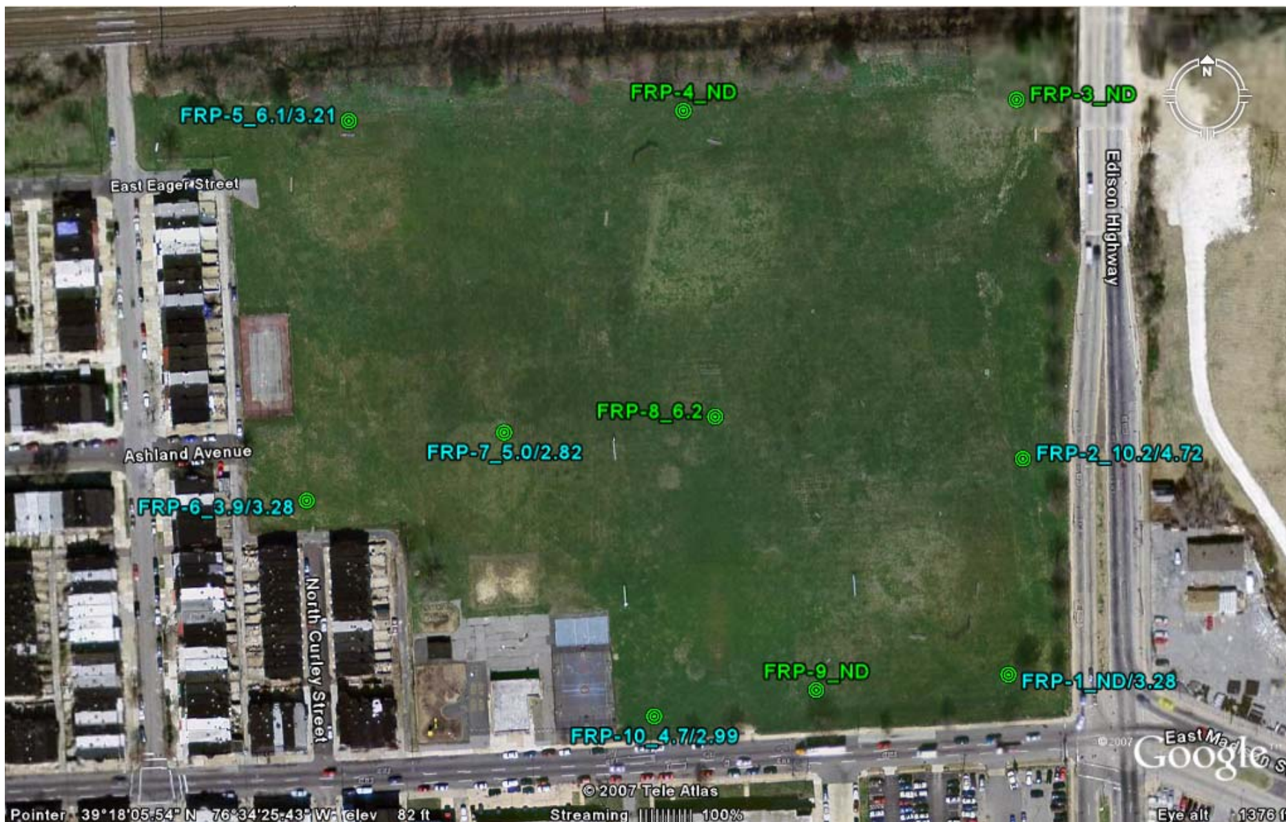
Green text – XRF data. Blue text - both MDE XRF and DHMH analysis run (XRF/DHMH).