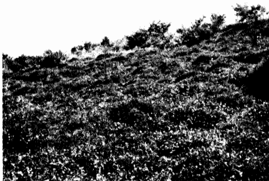
A steep slope stabilized using a combination of grasses, legumes and woody stems. Maryland's law prohibits strip mining on slopes greater than 20 degrees.

The primary reason for disapproval of eligible acres was failure to meet the requirement for 10 percent coverage with legume species. Erosion rills and gullies exceeding nine inches was the second most common reason for disapproval.