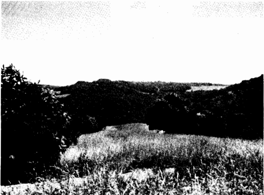
A revegetated strip mine creating ideal wildlife habitat. Strip mined areas can be used for pasturing, farming, woodland or recreational development if the landowner desires.

The Land Reclamation Committee voted to release 806 acres of the total acres eligible. These acres involve forty-nine permits operated by thirty-one different coal companies. Of the 806 acres approved for release, all were planted with a mixture of grasses and legume species to insure adequate erosion control protection. In addition to the herbaceous cover, trees for forestry purposes and trees and shrubs specifically planted for wildlife benefit were planted on 60 acres.