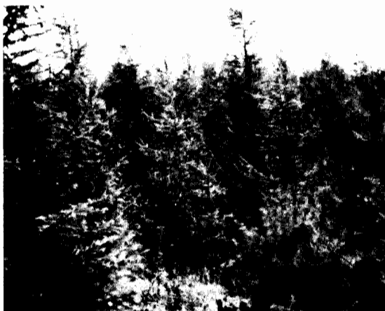
A strip mine revegetated with a mixture of coniferous species planted in 1968. After 10 growing seasons the area is well stabilized and producing wood fiber at rates comparable to adjacent undisturbed lands. Proper reclamation requirements greatly reduce the possibility of unsuccessful revegetation and long-term deterioration of mined lands.

The general public was given an opportunity to participate in the revegetation bond release process by attending two tours conducted this past summer. This opportunity will be expanded during the summer of 1979 with more tours planned. A list of acres eligible for revegetation bond release will be publicized, and interested citizens will have an opportunity to visit these areas by notifying the Bureau of Mines.