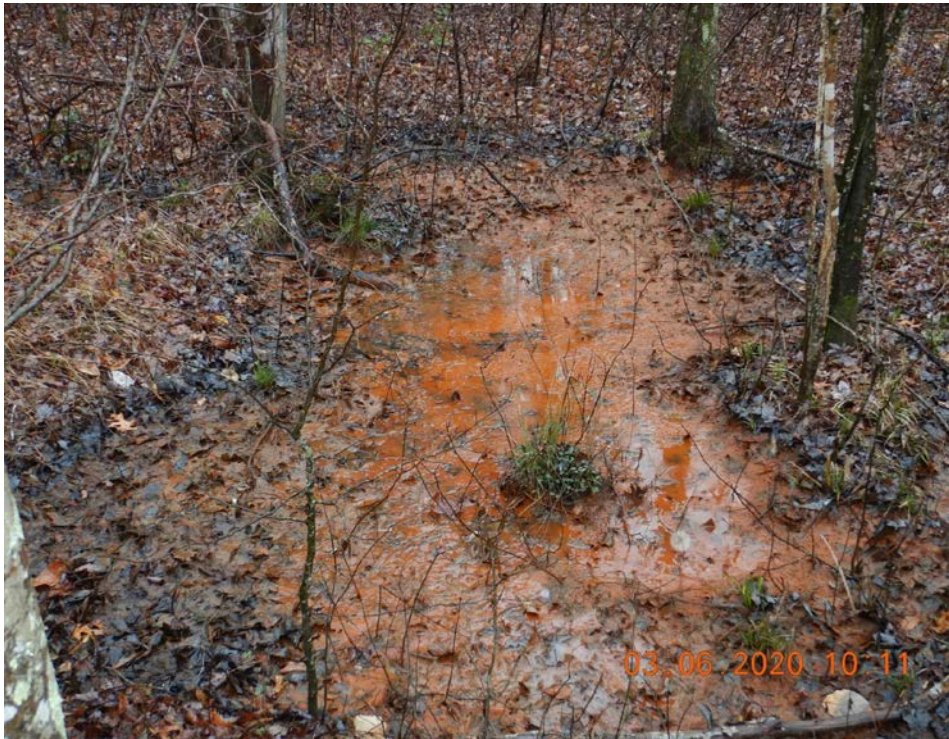
MDE File Photo.