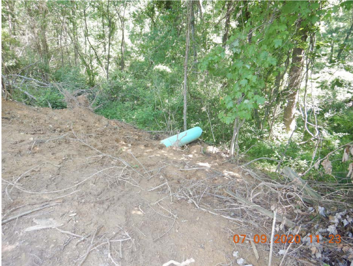
New outlet pipe installed