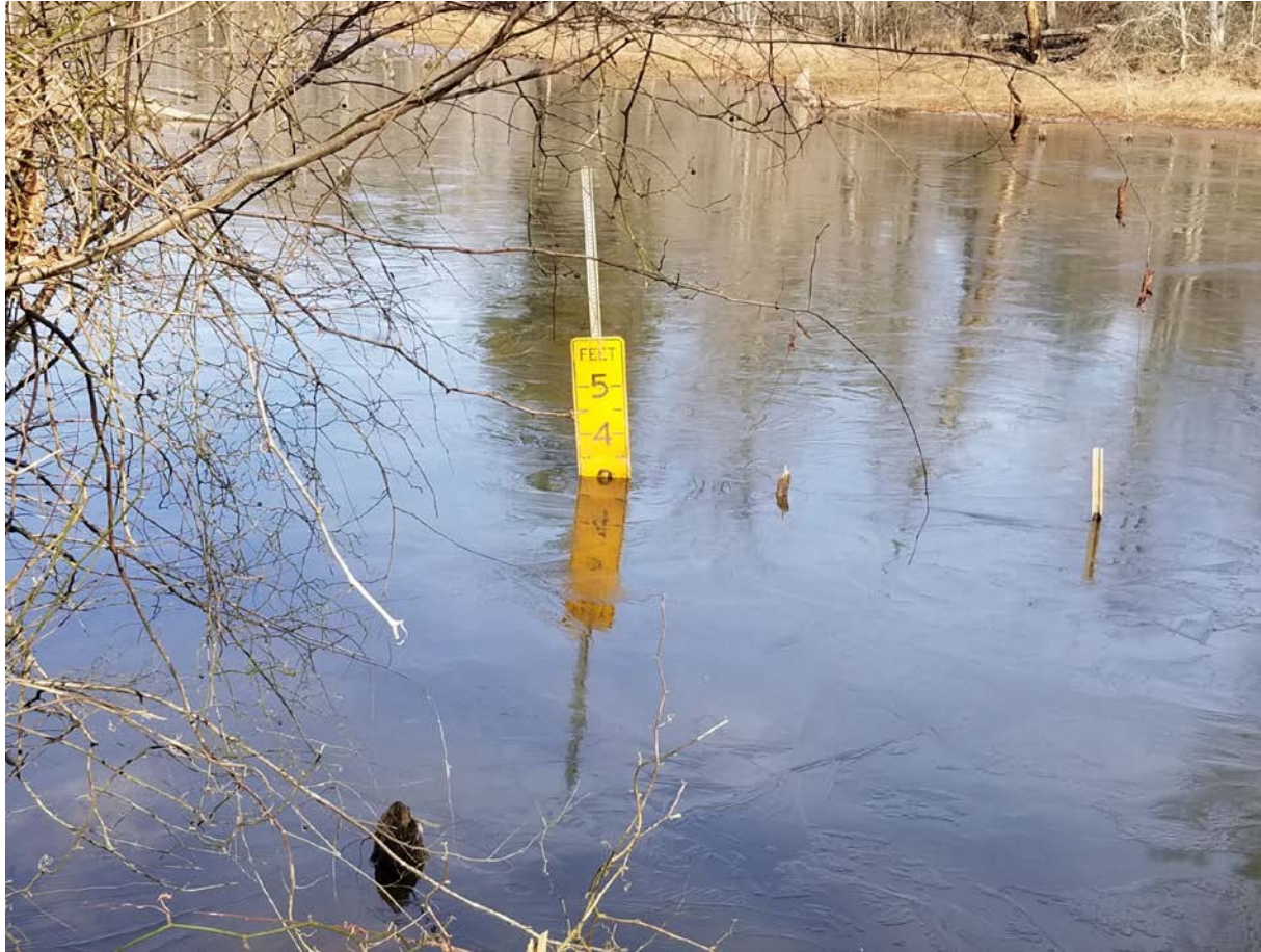
Water surface elevation of the lake.