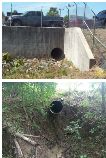
Figure B.1. The above outfalls are examples of locations that should be identified on storm drain maps and included in the permittee's screening program. Areas with highly developed land uses (e.g., commercial business complexes, aging infrastructure) have a greater potential to pollute and should be prioritized. Structural stability and erosion concerns should also be identified and corrected as part of an effective IDDE program.

As part of their IDDE programs, permittees must develop a map which identifies all outfalls and storm drain conveyance systems within the jurisdiction. Outfalls are end points where collected and concentrated stormwater flows are discharged from pipes, concrete channels, and other structures that transport stormwater within the jurisdictional property (see Figure B.1). Typically, an outfall would be the end of pipe where stormwater discharges to a stream. However, an outfall is not limited to stream bank discharge points. An end of pipe discharge may occur on a property above the receiving stream channel. These smaller pipes are good points to investigate in order to detect the source of an illicit discharge originating further up the system. An outfall can also be the discharge point of a stormwater management facility. In these instances; however, the inflow to the stormwater facility should also be mapped because an illicit discharge coming through the storm system is more likely to be detected at that location.