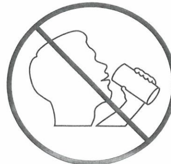
FIGURE 1301.3 PICTOGRAPH—DO NOT DRINK

1301.9 Nonpotable water storage tanks. Nonpotable water storage tanks shall comply with Sections 1301.9.1 through 1301.9.10.