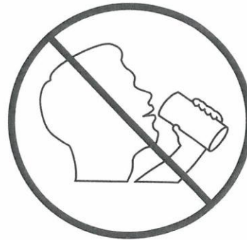
FIGURE 608.9.1 PICTOGRAPH—DO NOT DRINK

height and in colors in contrast to the background on which they are applied. In addition to the required wordage, the pictograph shown in Figure 608.9.1 shall appear on the required signage.